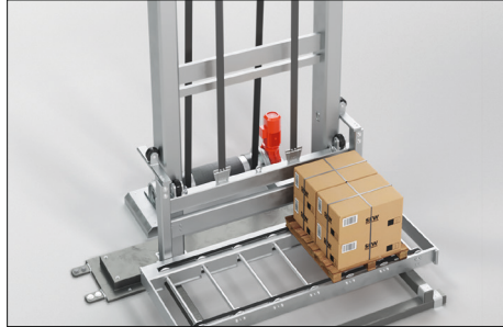
Vertical materials handling technology Hoist