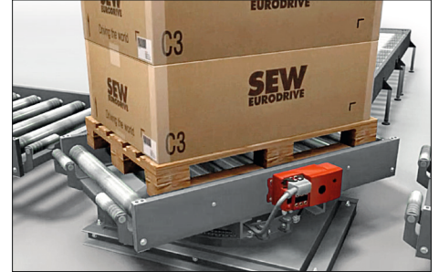
Materials handling technology with changes of direction Turntable, trolley