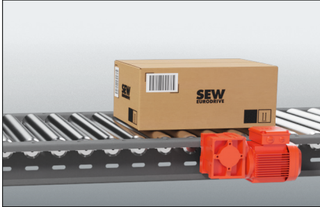
Horizontal materials handling technology Roller conveyor, chain conveyor, belt conveyor